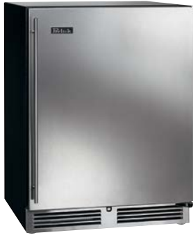
Solid Door Model

Perlick ® QUALITY & INNOVATION THAT INSPIRES