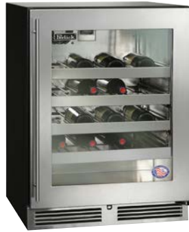
Glass Door Model