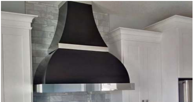
Designer Wall Mount