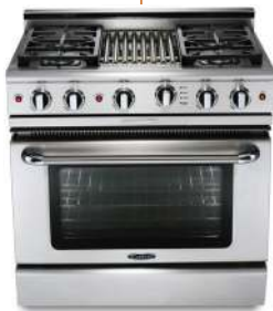
Self Clean GSCR36