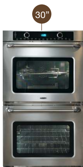
Double Self Clean Wall Oven MWOV302ES