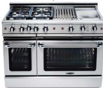
Self Clean GSCR48