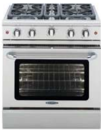
Manual Clean MCR30