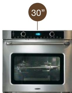
Single Self Clean Wall Oven MWOV301ES