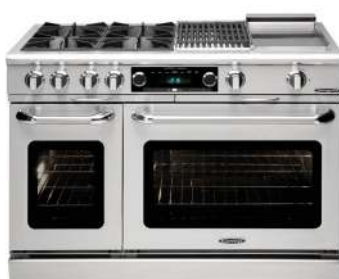
Self Clean COB48