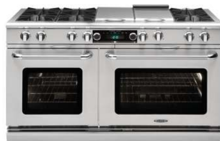
Self Clean COB60