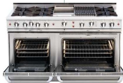
Self Clean CGSR60