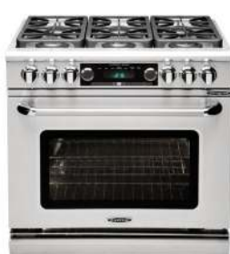
Self Clean CSB36