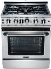
Self Clean GSCR30