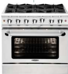
Manual Clean MCOR36