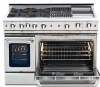
Self Clean CGSR48