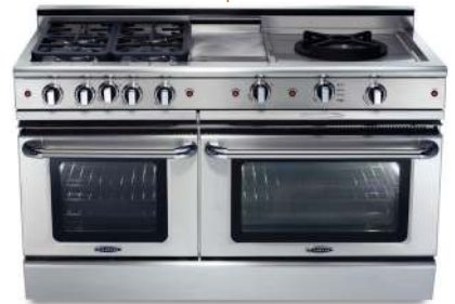
Self Clean GSCR60