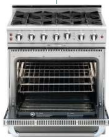
Self Clean CGSR36