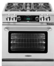
Self Clean CSB30