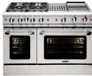
Manual Clean MCR48

Offering the largest oven capacity in it's class, the 30" Precision manual clean range offers an impressive 4.9 cu. ft. interior capacity.