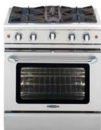
Manual Clean MCOR30