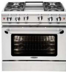
Manual Clean MCR36