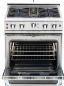
Self Clean CGSR30