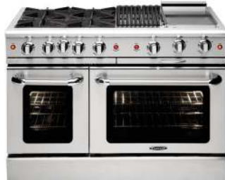
Manual Clean MCOR48

With a design that perfectly blends the look of commercial & residential, the Culinarian provides optimal heat delivery, power & function.