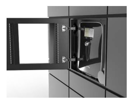
Trim Kit Open