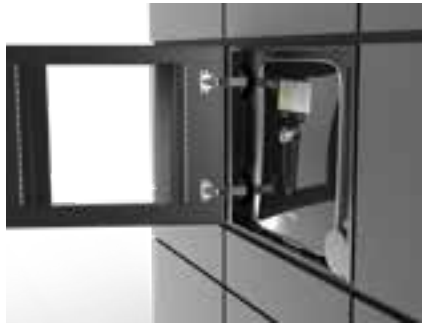
Built-in Kit Open (PLUM-TRIM24)