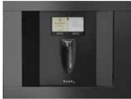
Built-in Kit Closed (PLUM-TRIM24)