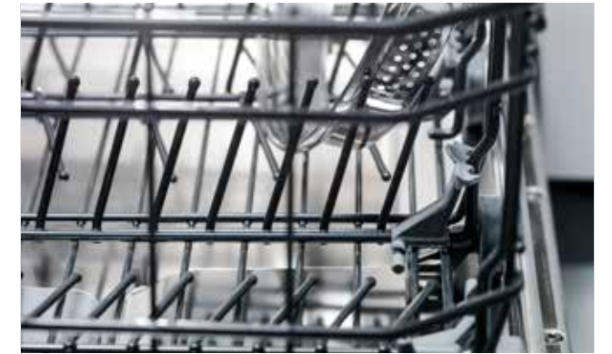
Adjustable tine rows maximize flexibility.

Our exclusive lower basket offers maximum flexibility and stability with divisible and foldable tines. This ensures a safe and efficient wash for both small and large plates. All parts in our baskets are made from high-quality steel, and therefore create flexible basket solutions that are extremely durable.