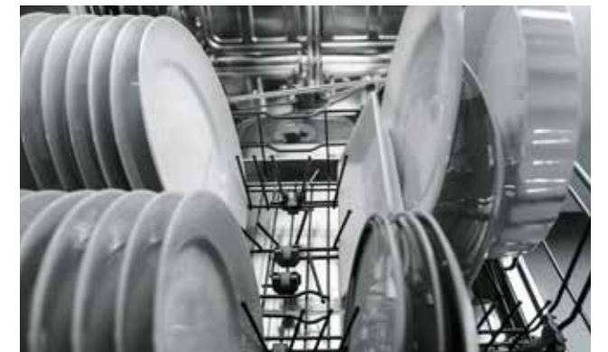
Load large plates with ease.