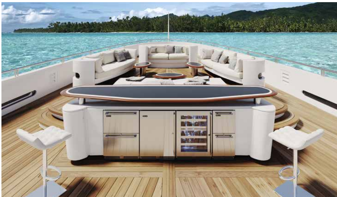
HP24BO-4-3L, 24" Signature Series Outdoor Beverage Center