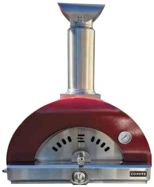
Shown in Red