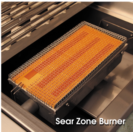
Sear Zone Burner

Buy any Artisan or Artisan Professional Series grill, and get your choice of a griddle or a sear zone burner FREE!*